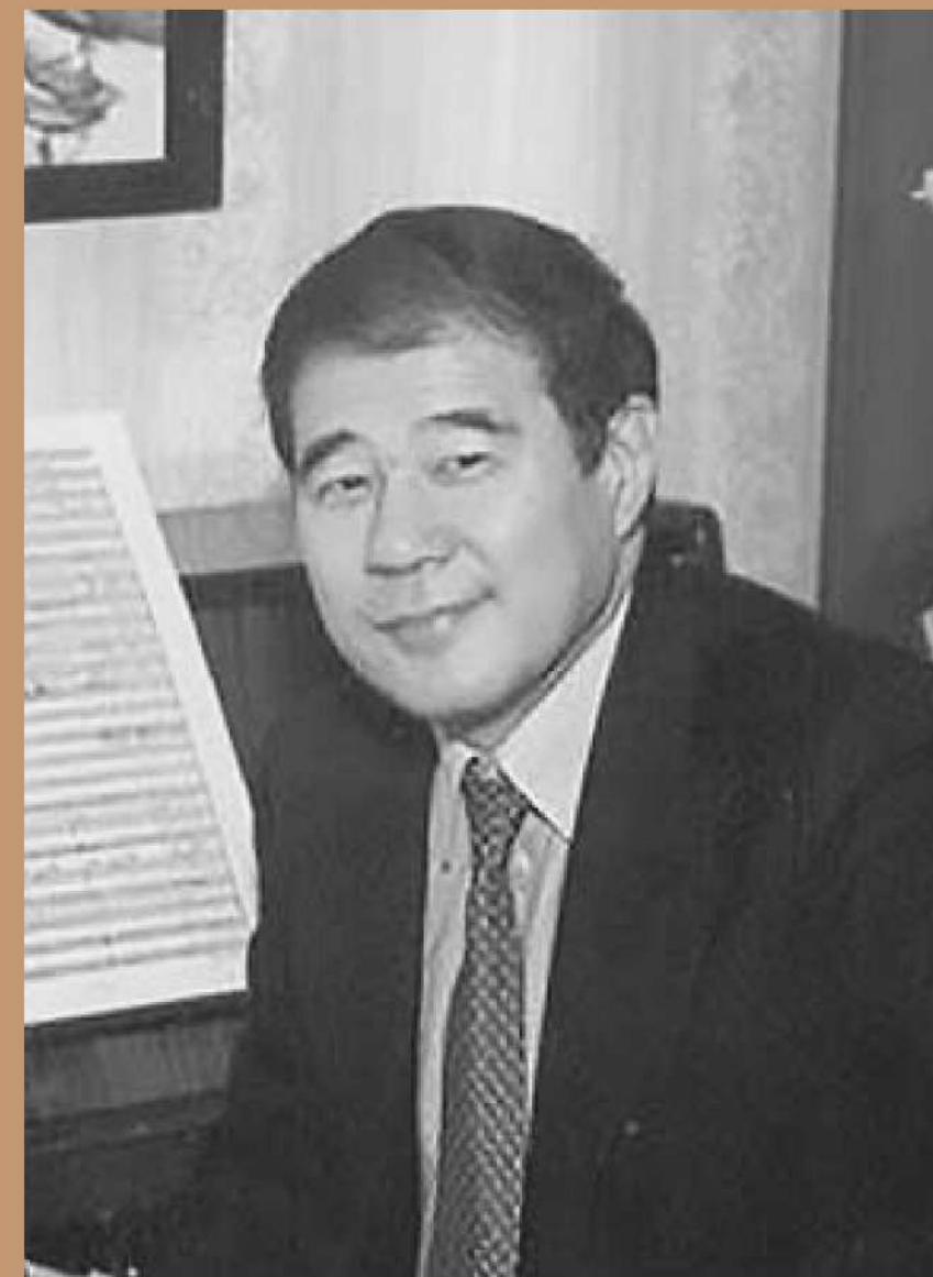
Zuo Zhenguan Composition and Orchestration Department

Lecturer at the Royal Conservatory of Scotland (Scotland)